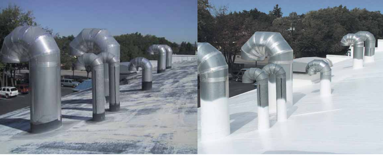
Before: Overview of existing 39-year-old Versico roofing system.