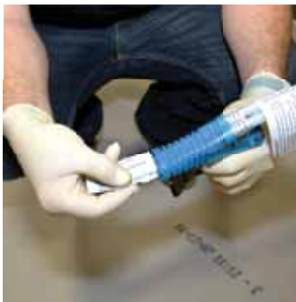
Application of petroleum jelly to spray gun