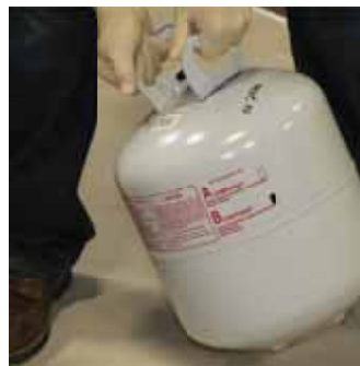
Shaking of A-side and B-side tanks