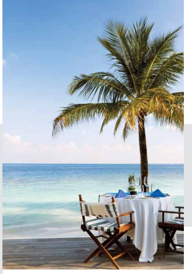
Locations subject to change without notice.

King's Court contractors have access to the Plus V Warranty Extension Program which provides an additional 5 years of warranty coverage at no cost. *See Plus V Brochure for program rules.