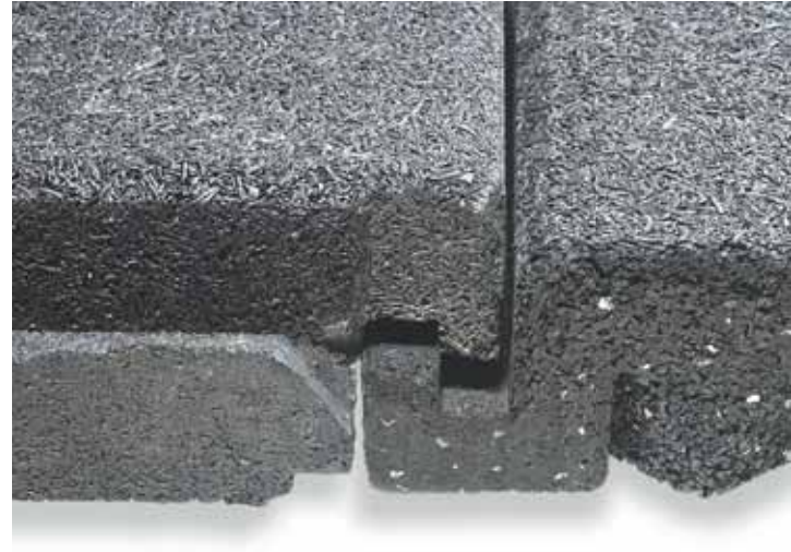
Close-up of the Versico Interlocking Rubber Paver locking technology.

Review current Versico specifications and details for specific application requirements.