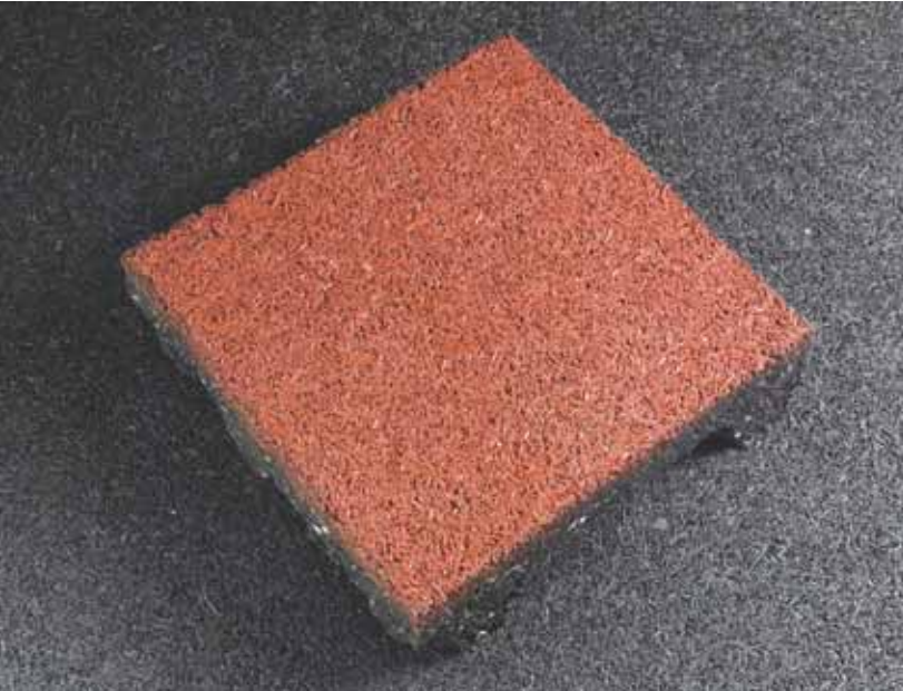
Versico Interlocking Rubber Pavers are available in black and terra cotta.