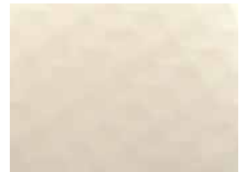
Versico VersiWeld – 60 Weeks (No Failure)