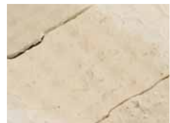
"Competitor C" TPO – 37 Weeks