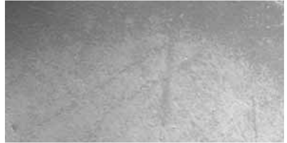
Versico TPO with OctaGuard XT

Versico has been at the forefront of TPO development for nearly 20 years and continues to lead the industry with its high-performance OctaGuard XT weathering package.