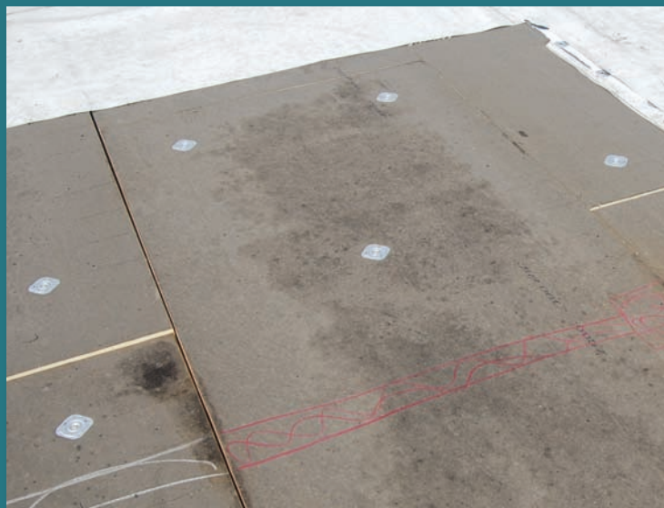
Mold growth and moisture led to interior dripping on this 18-month-old mechanically attached white roof system.