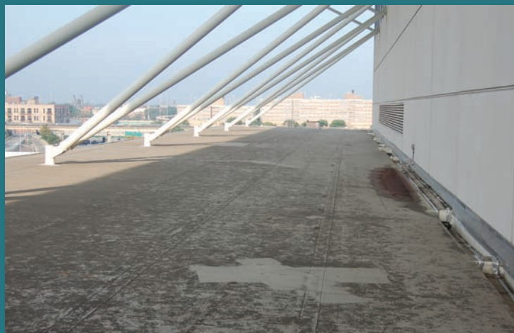
In just 15 months, the reflective benefits of this white roof were negated by excessive dirt build up.

can lead to long-term detrimental effects on roof-system performance.